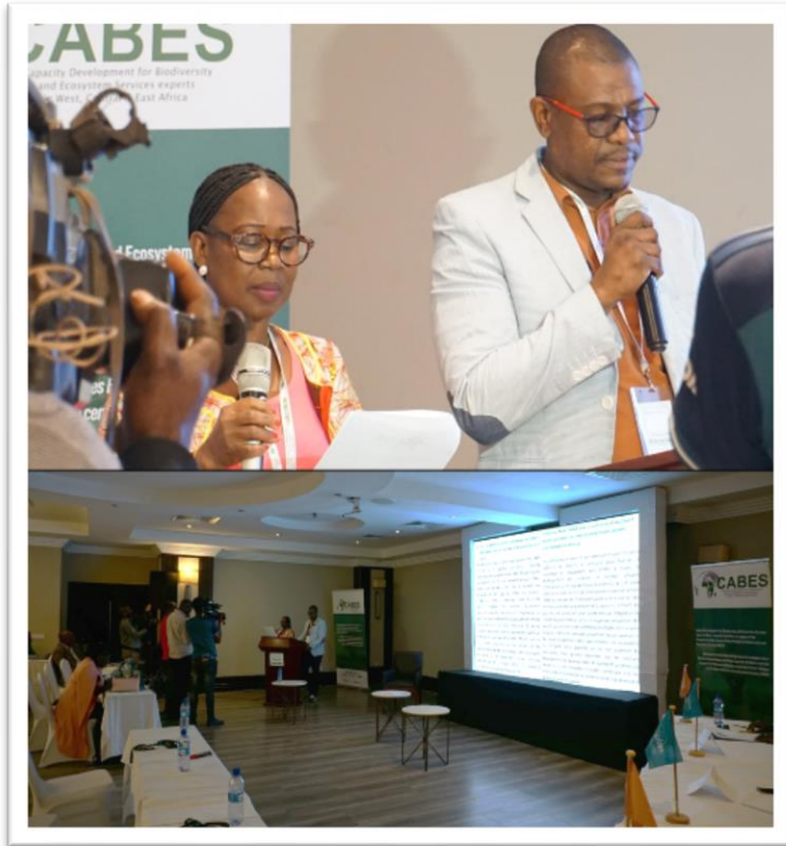
Figure 14. Reading of the final communiqué.

During the ceremony, certificates were symbolically awarded to six participants, comprising three women and three men. Other participants were invited to collect their certificates immediately following the event.