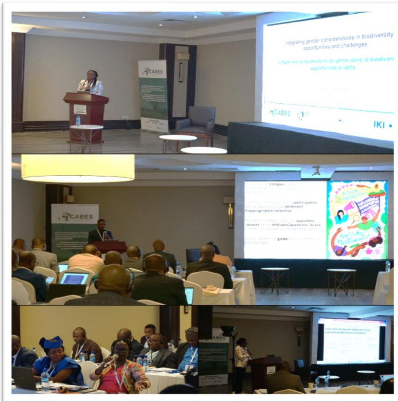
Figure 12. Illustration of presentations 5 and 6 in the afternoon of day 2.

research?" Participants were able to view the survey results in real-time, providing valuable insights into the collective perspectives of the group.