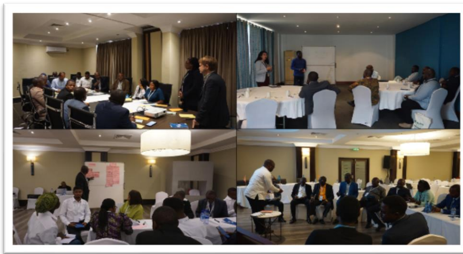
Figure 8. Some photos from the group discussions

The session concluded with the presentation of the group reports, highlighting key insights and recommendations from the discussions.