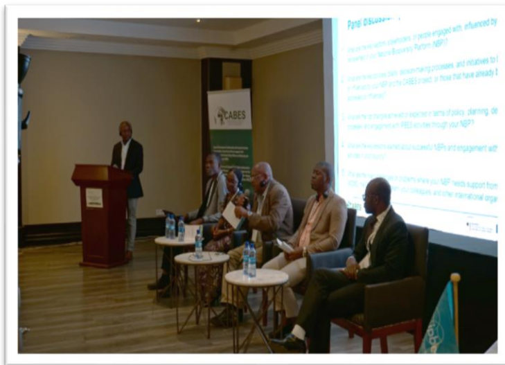
Figure 4. Cross-section of panelists during the Panel discussion on progress in implementing national biodiversity platforms.

Additionally, the representative of Gabon, although not an official panel member, was invited to provide insights into the advancements made in establishing a biodiversity platform in his country.