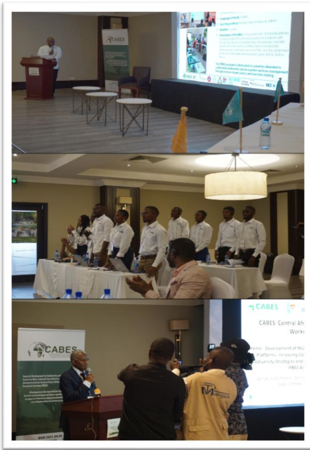
Figure 6. Photos from session 5 and speech by the Rector of the University of Lubumbashi.

Participants were then invited to the poster session, during which the 13 students from Lubumbashi's first cohort presented preliminary ideas for their research projects. The main aim of the session was to foster science-policy-practice interactions and to promote co-design and policy relevance of their planned research.