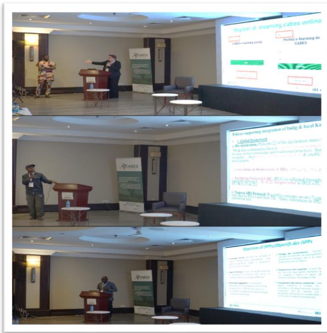
Figure 11. Illustration of presentations 2 - 4 from day 2.