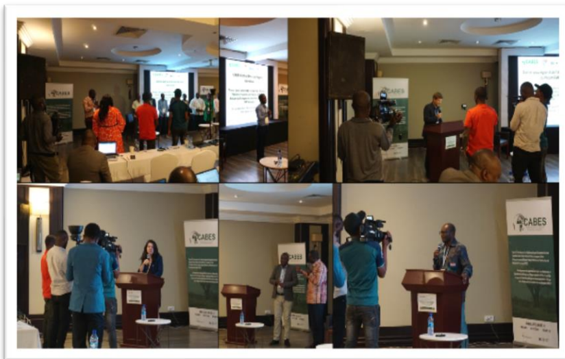
Figure 16. Illustration of the closing speeches.

The ceremony concluded with the singing of the DRC national anthem.