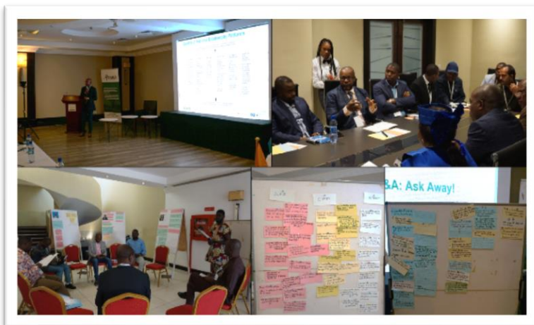
Figure 10. Some photos of the first session and group work on the second day.