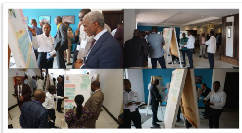
Figure 7. Some photos from the poster session focusing on the research themes of the first cohort of SPIBES Master's students at UNILU.