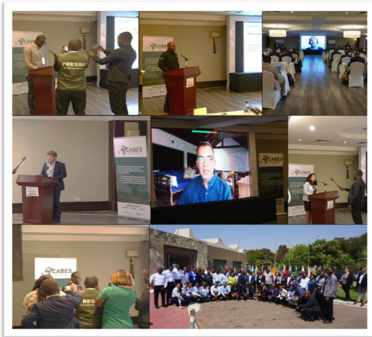
Figure 1. Photos from the opening ceremony