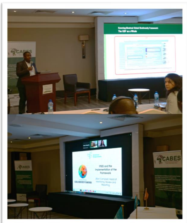
Figure 5. Presentations from session 4.

The session concluded with an engaging question-and-answer segment, allowing participants to delve deeper into the topics presented.