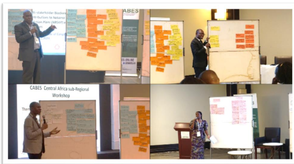
Figure 9. Some photos of the plenary ('reporting back') session