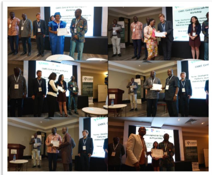
Figure 15. Illustration of the presentation of certificates.

During the ceremony, certificates were symbolically awarded to six participants, comprising three women and three men. Other participants were invited to collect their certificates immediately following the event.