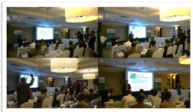
Figure 2. Cross-section of workshop participants during the ice-breaker session Summary of the Second Session

The second session comprised three consecutive presentations, each addressing critical aspects of biodiversity and ecosystem services.